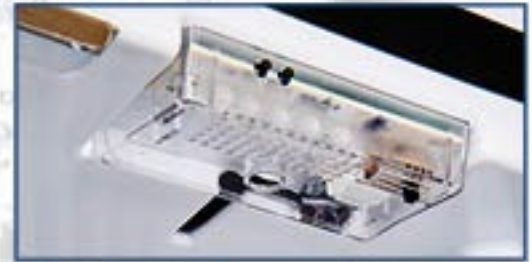
Multi-Stage Adjustable Thermostat