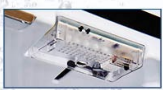
Multi-Stage Adjustable Thermostat

Specifications may change without notice due to continuous product development.