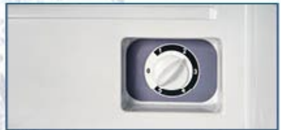
Adjustable Mechanical Thermostat