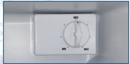
Adjustable Mechanical Thermostat