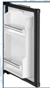
27L Door Rail