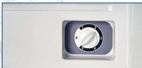
Adjustable Mechanical Thermostat