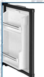
27L Door Rail