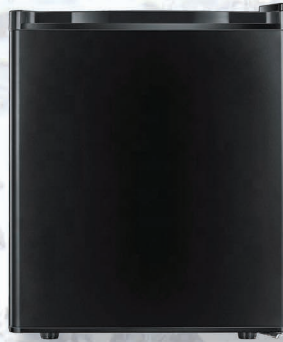
Primo Thermo 40 solid black door