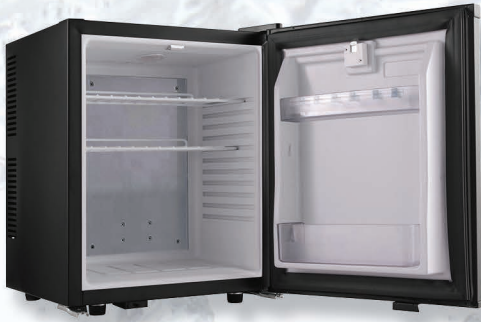
Primo Thermo 30 solid black door

XC-30, XC-30A, XC-30AGD, XC-40, XC-40A, XC-40AGD, XC-60, XC-60AGD, XC-42D