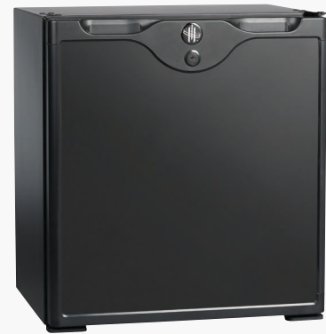
Solid Black Door