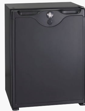
Solid Black Door

*Average energy consumption per 24 hours, at 25°C (77°F) ambient temperature and 7°C (44.6°F) cooling temperature, in compliance with EN ISO 7371.