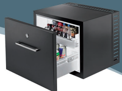
PRIMO 42D Drawer

MINIBAR SYSTEMS smart bars • smart people • smart solutions