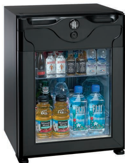
PRIMO 30 Glass Door

PRIMO minibars have been quality engineered – with generous internal space, simple and stylish design, low energy consumption and silent absorption technology . It's a great value for your hotel.