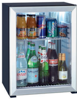
PRIMO 40 Aluminium Glass Door