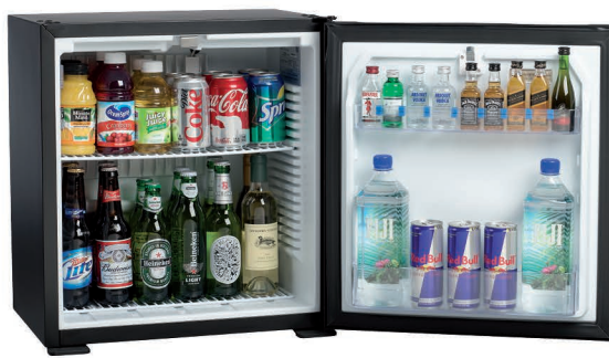
PRIMO 60 Solid Door